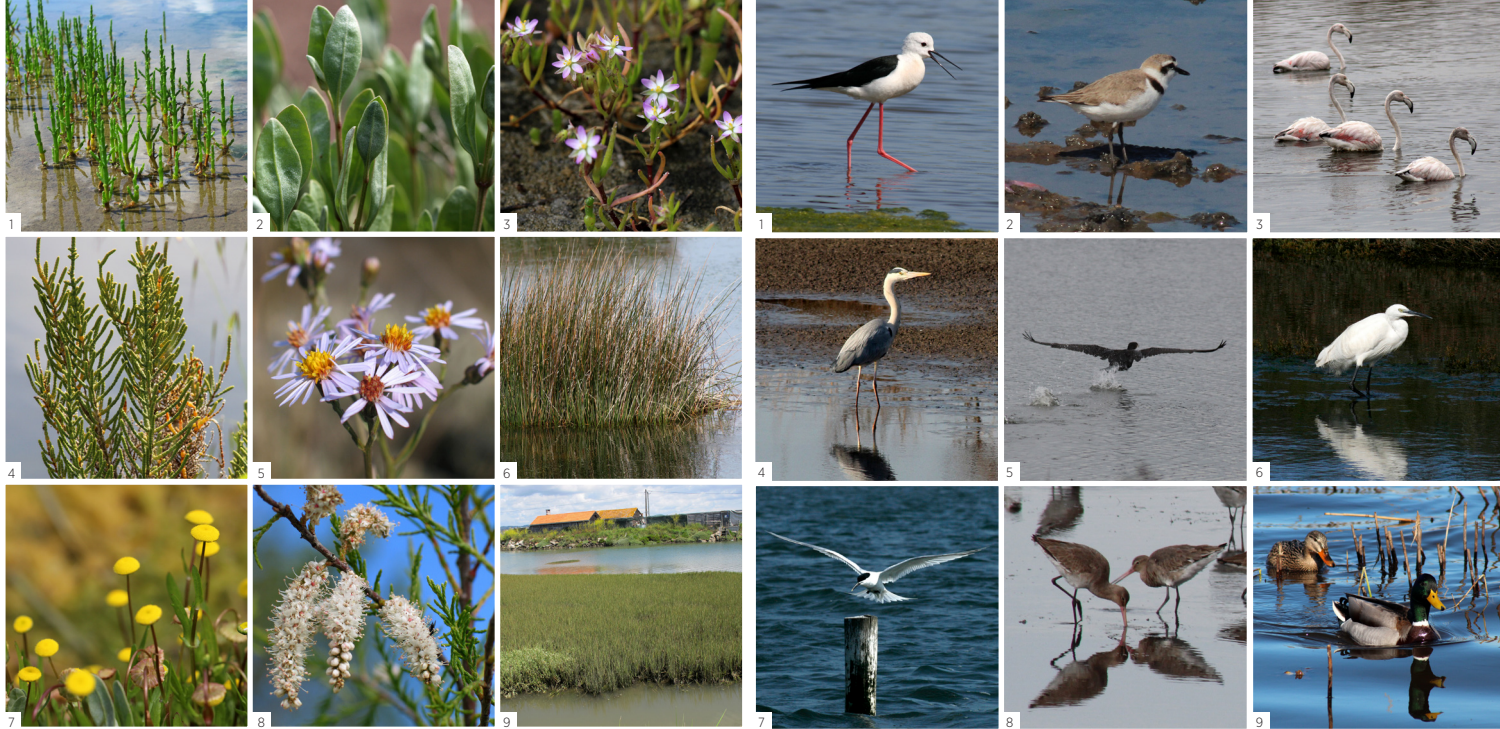
Flora 1 Glasswort Salicornia ramosissima 2 Sea purslane Halimione portulacoides 3 Lesser sea-spurrey Spergularia marina 4 Sarcocornia fruticosa 5 Sea aster Aster tripolium subsp. pannonicus 6 Sea rush Juncus maritimus 7 Brass-buttons Cotula coronopifolia 8 Salt cedar Tamarix africana 9 Small cordgrass Spartina maritima